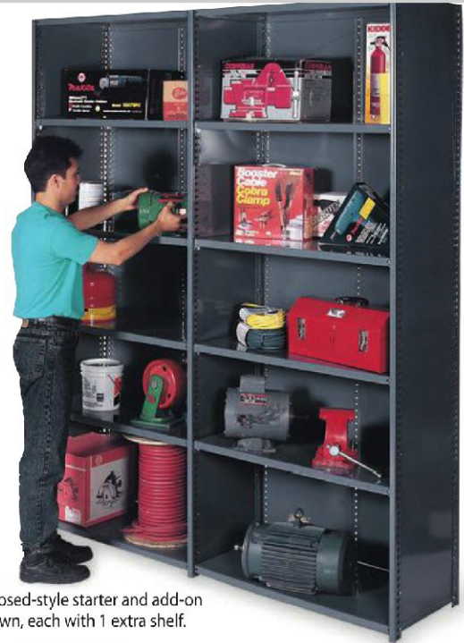
5-shelf closed-style starter and add-on units shown, each with 1 extra shelf.