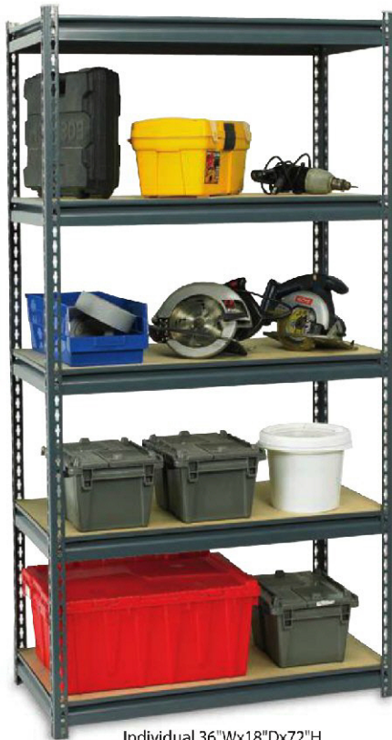
Individual 36"Wx18"Dx72"H Shelving Unit Shown