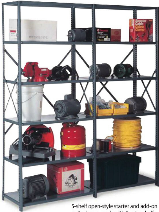
5-shelf open-style starter and add-on units shown, each with 1 extra shelf.

Common front box posts cut assembly time when connecting two or more units. Shelves feature welded tubular box on front and rear edges as well as lapped and welded corners for extra strength. Posts are punched on 1" centers. Begin with starter units and use add-ons as needed to complete rows. Available as open- or closed-style shelving. Made in USA. IN STOCK.