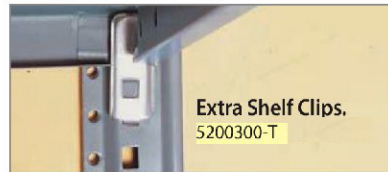
Extra Shelf Clips, 5200300-T

20-gauge box shelf with lapped and welded corners provides greater strength for maximum load capacity.