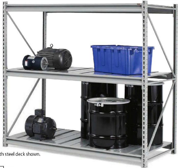
72x36x72" starter with steel deck shown.