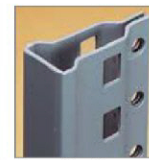
Front Box Post

20-gauge box shelf with lapped and welded corners provides greater strength for maximum load capacity.