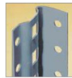
Rear Angle Post

14-ga. box-formed post cuts assembly time when connecting two or more units. Punched on 1" centers.