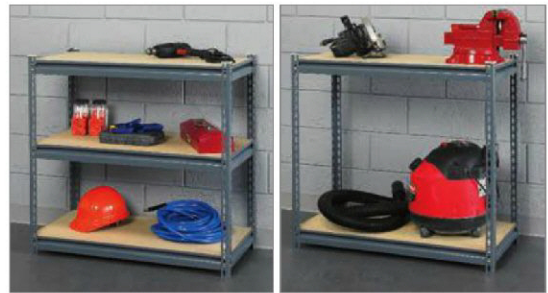
Split-post design configures as either (1) 72"H or (2) 36"H units.