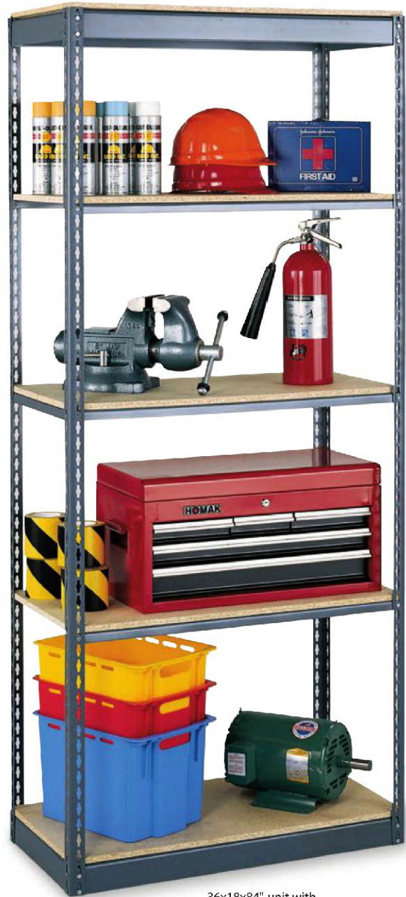
36x18x84" unit with particleboard decking shown.