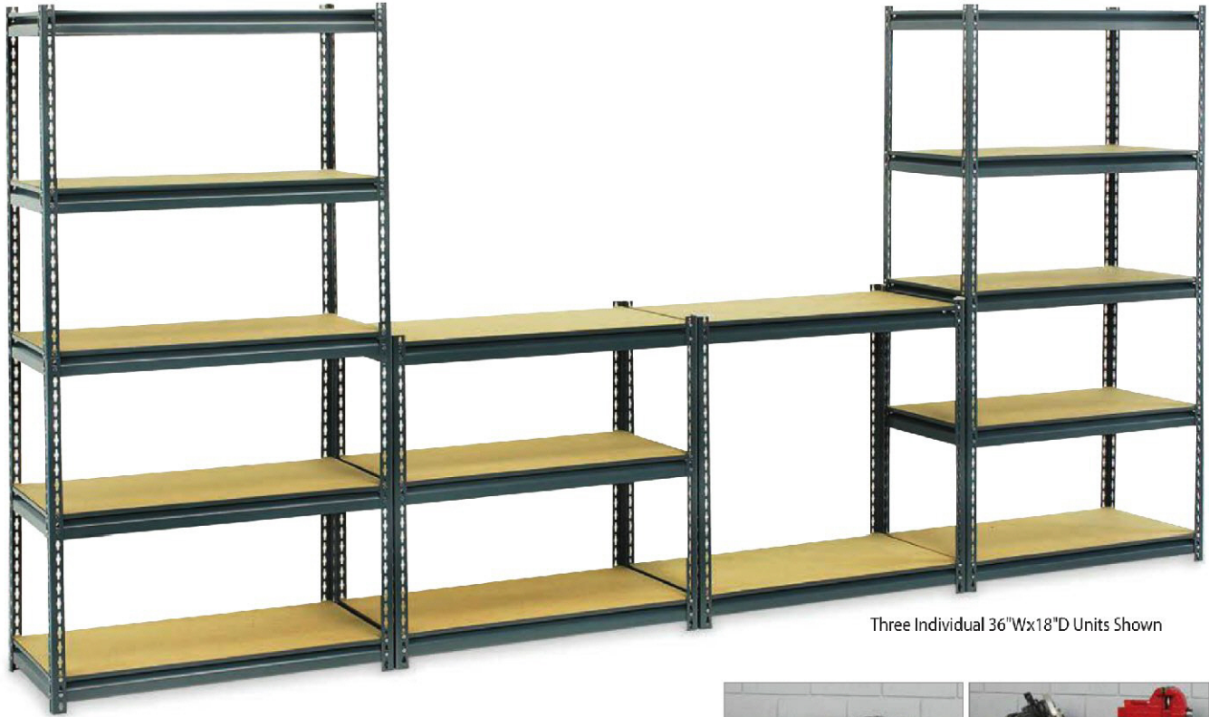
Three Individual 36"Wx18"D Units Shown